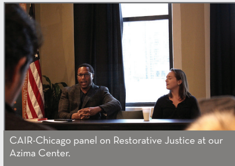
CAIR-Chicago panel on Restorative Justice at our Azima Center.

CAIR-Chicago continues to work with the Muslim inmate community in having their grievances timely processed and heard by their respective institutions.