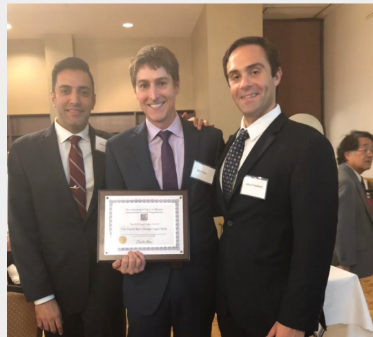
TAP Coordinators receive Legal Eagle award